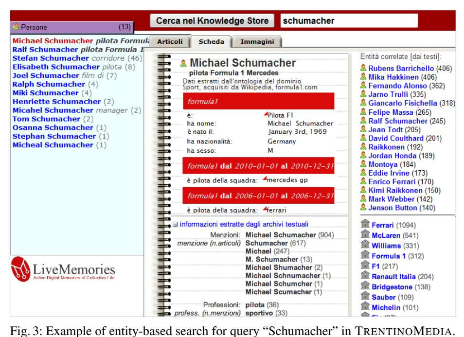
Fig. 3: Example of entity-based search for query "Schumacher" in TRENTINOMEDIA.