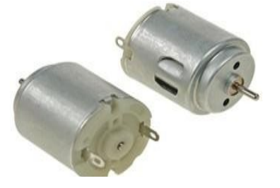
Figure 3: DC Motors

DC motors are used here for high RPM(Revolution Per Minute). This will help the darts to cover a larger distance with more rpm. The DC motor is the device which converts the direct current into mechanical energy. Lorentz Law is the basic principle of DC motors, which states that the current-carrying conductor placed in a magnetic and electric field experiences a force [8].