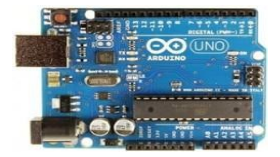
Figure 4: Arduino Uno

Arduino UNO is a microcontroller of 8 bit based on ATmega328P which acts as the brain of the system which controls all the devices. It has 14 digital I/O(input-output) pins, 6 analog inputs, a quartz crysta of 16MHz, a power jack, a USB connection, an ICSP header, and a reset button [9].