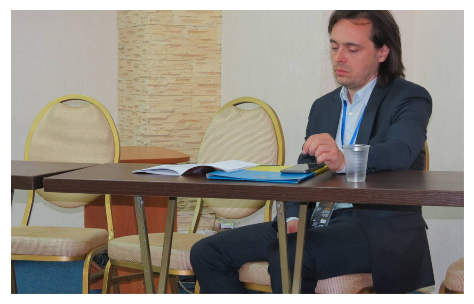
Fig. 9. The coronavirus sadness [20] of Prof. Andriy Matviychuk before the talk on machine learning approaches for financial time series forecasting [4]

price information. To check the efficiency of these models was made out-of-sample forecast for selected time series by using one step ahead technique. The accuracy rates of the forecasted prices by using ML models were calculated. The results verify the applicability of the ML approach for the forecasting of financial time series. The best out of sample accuracy of short-term prediction daily close prices for selected time series obtained by SGBM and MLP in terms of Mean Absolute Percentage Error (MAPE) was within 0.46-3.71 %. The results are comparable with accuracy obtained by Deep learning approaches.