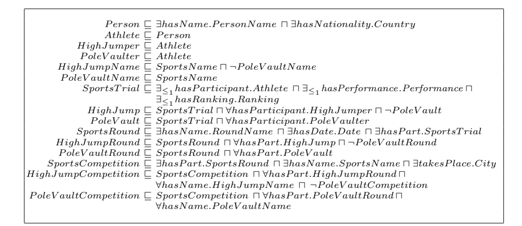
Fig. 3. An example Tbox for the athletics domain (see http://www.boemie.org/ for an extended version).

Q_1 := \{() \mid sportsNameToDate(hjName_1, date_1)\}