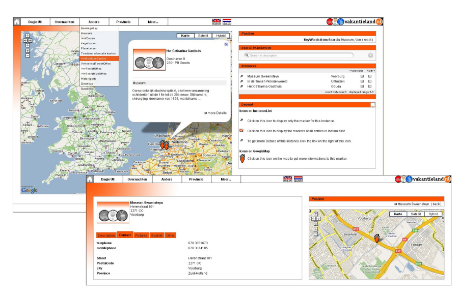
Figure 3: GUI of the new vakantieland.nl portal

The structure of the application, which is implemented in the script language PHP<sup>7</sup> follows a well known architectural pattern called MVC<sup>8</sup> [Bu98]. The model component abstracts the accesses by the controller on the Powl-API, which in this case also manages the extraction of data from the TripletStore to make the data suitable for the requirements. The RAP<sup>9</sup>-API [OB04] which is used by the Powl-Api allows to query the model with SPARQL [Be06]. SPARQL was used to identify and find resources with specified characteristics in an efficient manner. After the identification of the resource URI, an object with all the existing information is created with the Powl-API. Such generated objects will be requested by the appropriate controller and assigned to the view component. The view component produce the output with the help of templates.