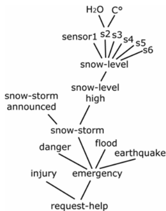
Figure 1. A difference space. Each difference is not a symbol but a specific process.

For example the difference space detecting some emergency may unfold into difference spaces detecting the presence of danger or particular weather hazards such as a snow-storm , which itself depends of the fact that a snow storm has been announced or a direct control of the snow level, depending of the process (cf. Figure 1).