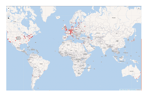
Fig. 1. Map in Scholia with international collaborators of authors based in the Netherlands.

shows the page for Tübingen and that Knowledge Media Research Center and Forschungsstelle für Verkehrs-. Planunas-. Technikund Datenschutzrecht are amongst the nearby organizations. For this list, the SPARQL query identigeographic fies the coordinates with Tübingen associated and