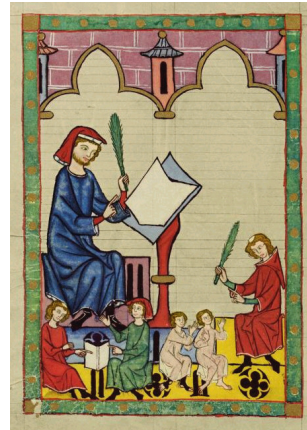
Fig. 1. “Schulmeister von Esslingen”: traditional teacher-centred learning

In our dynamic society, learning plays an increasingly important role, and the way learning is perceived has changed significantly. Whereas traditionally learning was limited to school and university, it is now seen as a life-long process (“ life-long learning ”) requiring learners to constantly update and adapt their knowledge to new developments [8]. Whereas school and university teaching often used to be rather transfer of information from the teacher to the students without much student