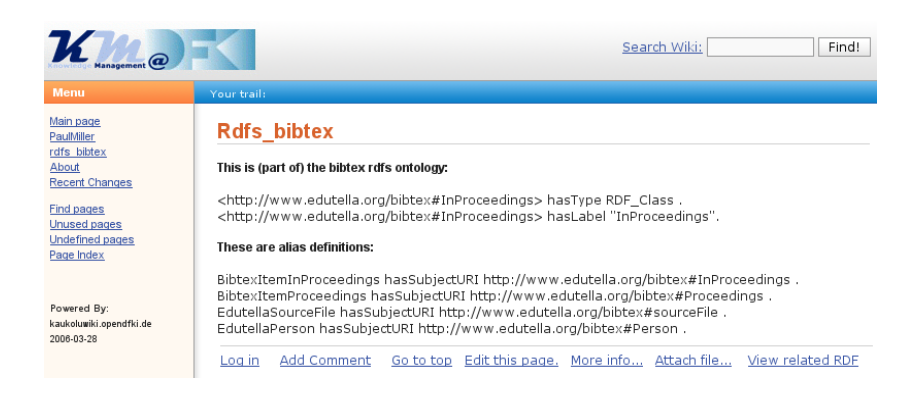
Fig. 3. The wiki page holding the bibtex RDFS ontology.

Ontology Import: In Figure 3, we see a wiki page holding the bibtex RDFS ontology used for our publication list. Any RDFS ontologies can get imported. On import, they will be converted to RDF wiki syntax which is similar to N3 [1]. Ontologies can be created using ontology editors such as Protégé-2000 [8]. Note that one can now collaboratively edit the ontology within Kaukolu. Export to RDFS is also possible using the "View related RDF" button to the lower right. Updating the ontology can be done either directly in the wiki or by re–importing the ontology.