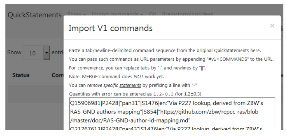
Fig. 2. Import statements for QuickStatements2 . The first input line adds the RAS ID "pan31" to the item for the economist James Andreoni. The rest of the input line creates a reference to ZBWs mapping for this statement and so allows tracking its provenance in Wikidata

That step resulted in 384 added GND IDs to items identified by RAS ID, and, in the reverse direction, 77 added RAS IDs to items identified by GND ID. For the future, it is expected that tools like wdmapper <sup>16</sup> will facilitate such operations.