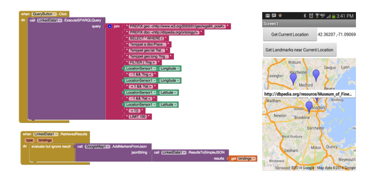
Fig. 1: Consuming Linked Data. Left: Logic used for obtaining the user's location, constructing a SPARQL query, querying a remote endpoint, and displaying the retrieved results on a map. Right: Output as seen on the phone. 'QueryButton' in the blocks editor is the name of the button with the label 'Get Landmarks near Current Location' as seen on the phone.