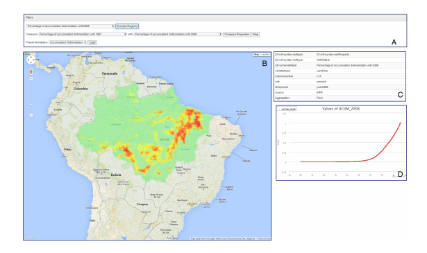
Fig. 1. Explorer for Linked Brazilian Amazon Rainforest (ELBAR). The interface contains four sections: A - Filters, B - Map, C - Info window, D - Graph

In this demonstration, ELBAR<sup>4</sup> makes use of the openly available Linked Brazilian Amazon Rainforest Data<sup>5</sup> [2] which captures and shares environmental observations (like deforestation) together with information about social phenomena (like amount of population) and economical phenomena (like market prices of products). The data has been aggregated to 25 km x 25 km grid cells [1] and extended with open governmental data and linked to DBPedia. ELBAR uses the paradigm of visual animations to illustrate changes over time on maps. The core idea is that employing such means to navigate multiple dimensions of data supports analysts in generating hypotheses for further investigation.