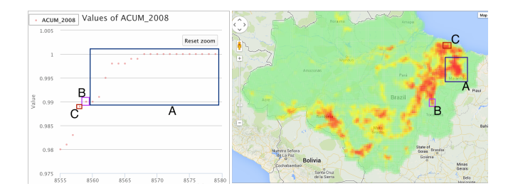
Fig. 2. User interactions on graphs translate to highlight visual elements on the map, aiding in providing context

Assuming a user would like to understand a certain phenomena over time (like deforestation) she/he will select a property (like deforestation rate) to visualise it on the map. The explorer then presents the corresponding values of the property, color-coded and overlaid on the map as well as a distribution of the values of the property as a graph. The graph (see the the bottom right of Figure 1) is interactive and supports mouse events such as zoom (by clicking and dragging to select a section in the graph) or left clicks.