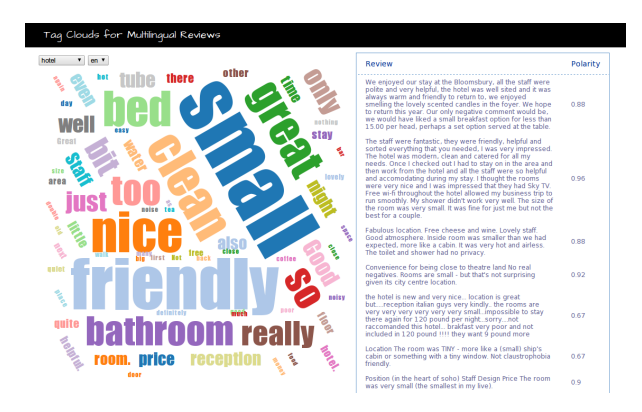
Fig. 2. Simple service that uses the resources in EUROSENTIMENT to analyse opinions in different languages and domains